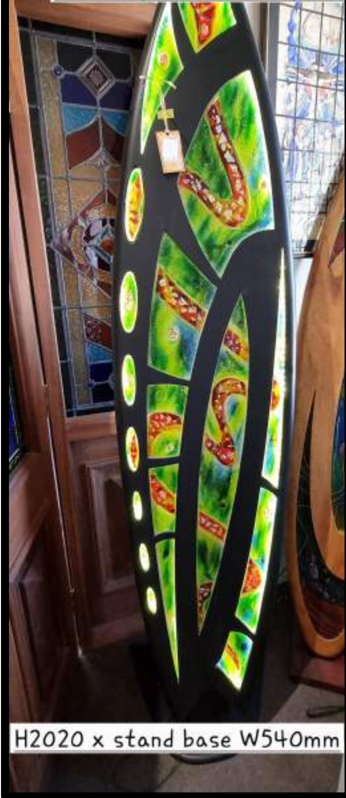
H2020 x stand base W540mm