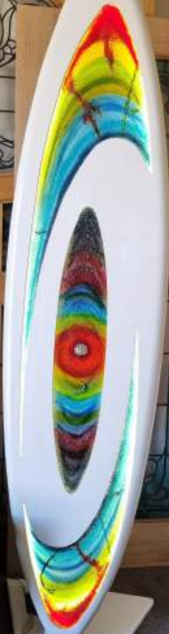
H2180xW540mm at base