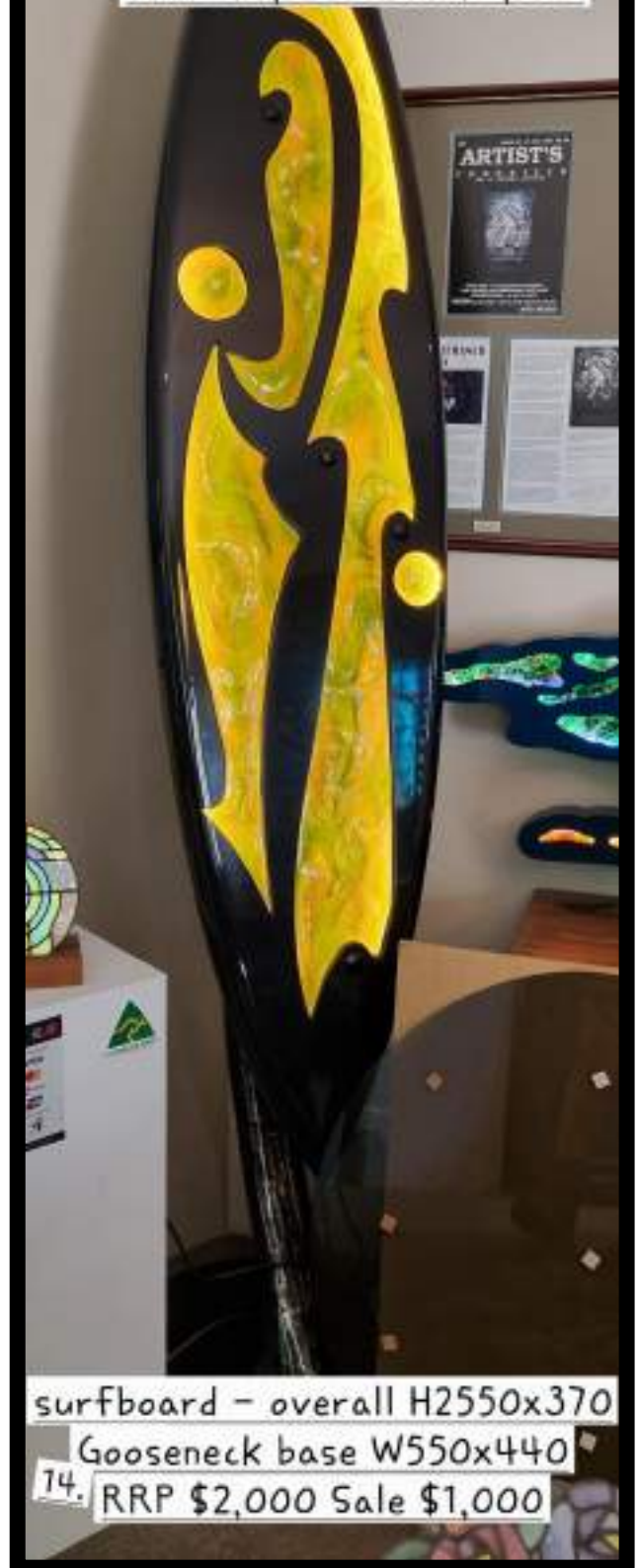
surfboard - overall H2550x370 Gooseneck base W550x440 74. RRP $2,000 Sale $1,000