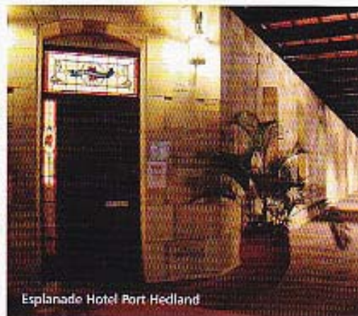
Esplanade Hotel Port Hedland