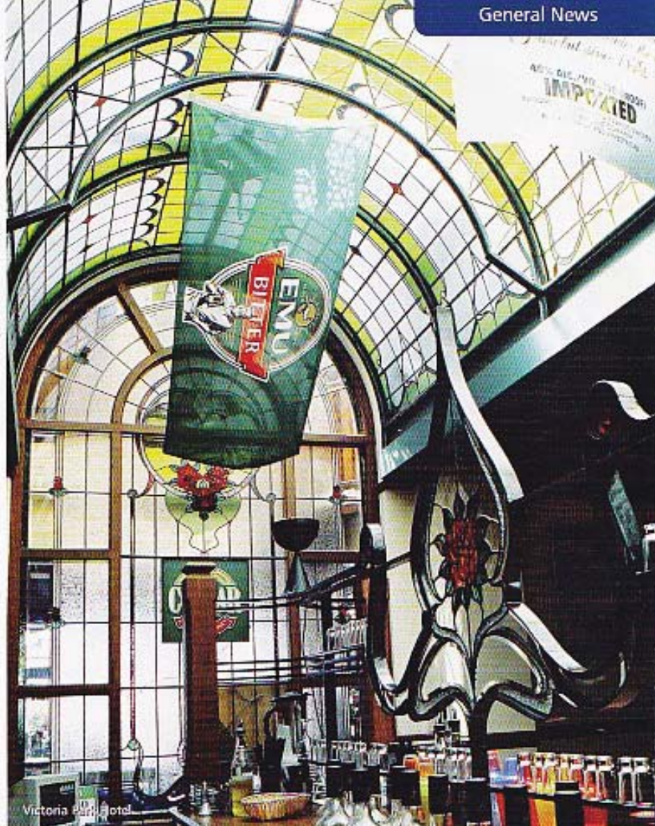
Victoria Park Hotel