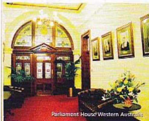
Parliament House Western Australia

"Our art glass has also been very useful for partitioning off rooms and helping create privacy and intimacy for that particular venue. Domes and skylights are always unique and an eye catching idea for hotels and