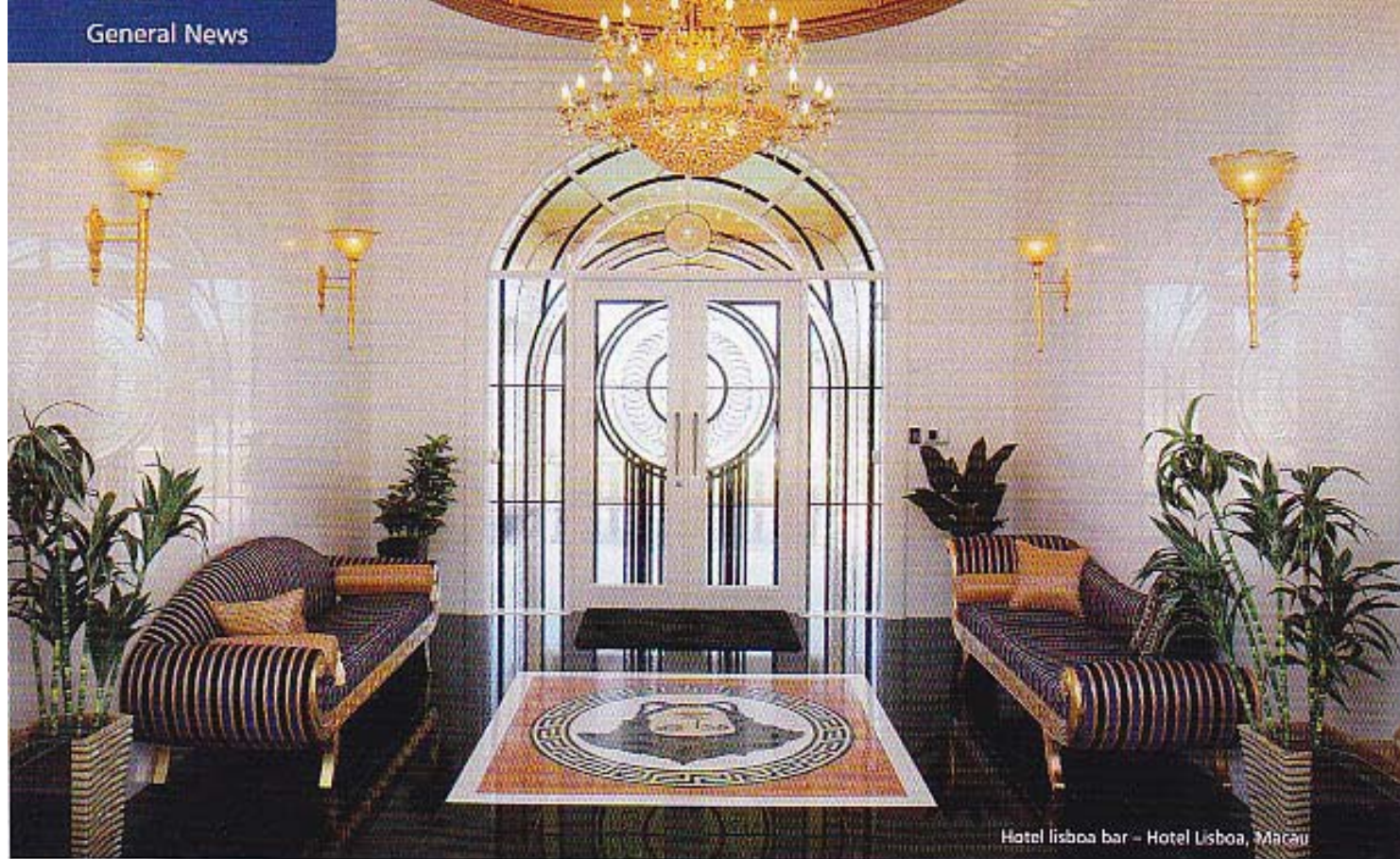
Hotel Lisboa bar - Hotel Lisboa, Macau